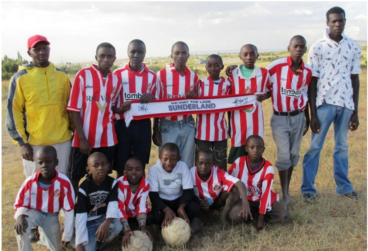
SOME OF THE ACADEMY CHILDREN NOW, WITH THEIR COACHES